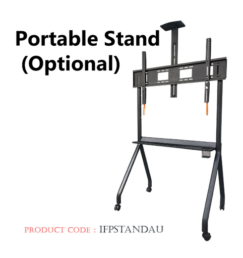
This (Optional) Product Is Not Included With This Interactive Smart Board